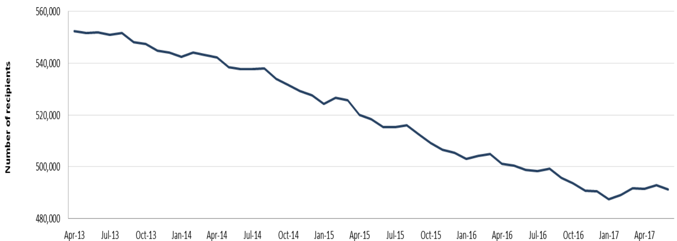
Chart 1: CTR recipients in Scotland, April 2013 to June 2017